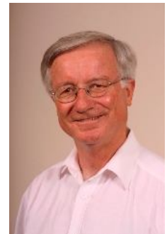
The Hon. Fred Chaney AO

The annual Lowitja O'Donoghue Oration is conducted during Reconciliation Week in Adelaide at the time that marks the referendum to change the Australian Constitution to count Indigenous Australians as citizens. The Oration honours Lowitja O'Donoghue AC, CBE