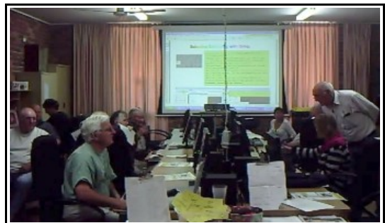
GIMP Image Manipulation class working on adjusting image quality, (Wednesdays).

pointer over it and the open windows on your desktop will fade. It's just like the show desktop icon of the old days, only better!