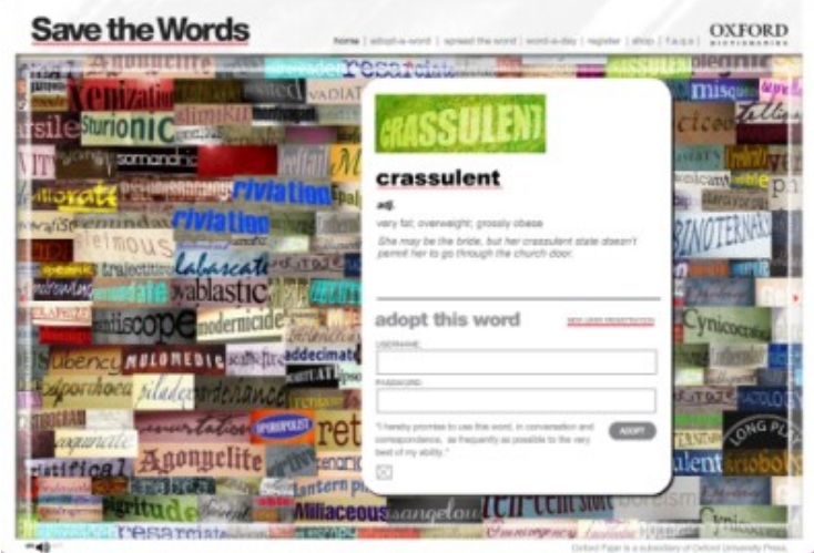
Image of the web site

But there are also words that could be lost through lack of use, which brings me the 'Save the Words' web site.